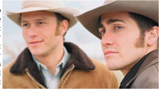
Heath Ledger and Jake Gyllenhaal

We, on the other hand, as Christians, know that it's not right to be a homosexual. When God talks about homosexuality in the